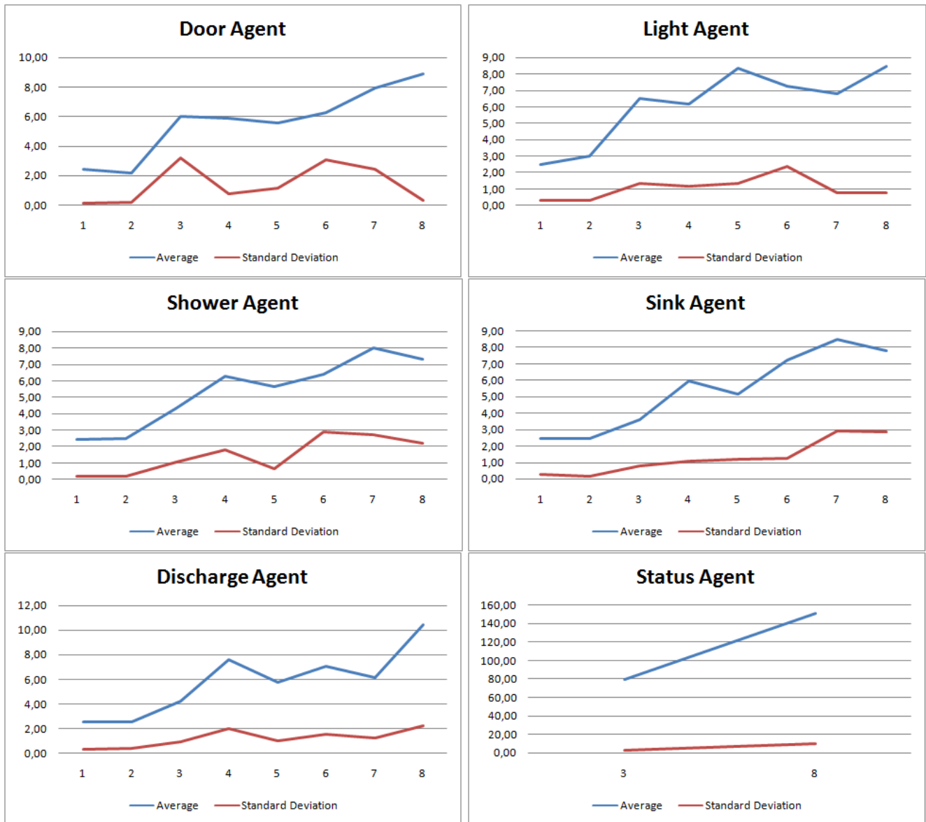
Figure 4. The results for some of the agents of the smart bathroom (seconds per number of agents employed in tests).

considered the time of execution from free status until it comes back to free status again). Again, we performed three repetitions for each of the following two cases: the agent status , the ARGO agent and more two standard agents; and the agent status , the ARGO agent, and more seven simple agents. The results show the same pattern of the former results of basic functions.