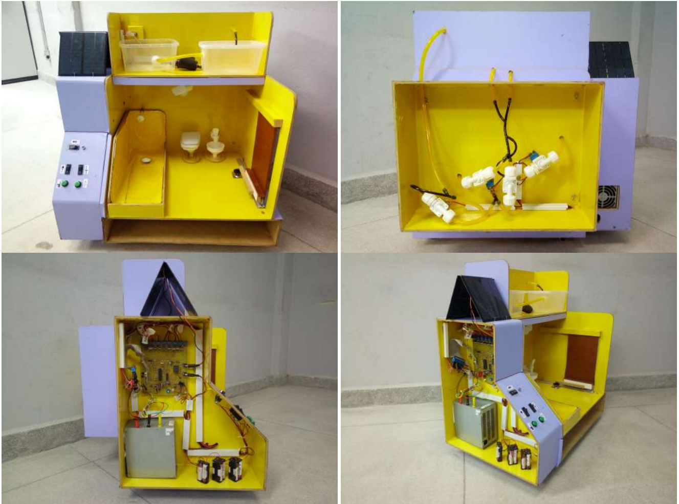
Figure 2. The Smart Bathroom Prototype.